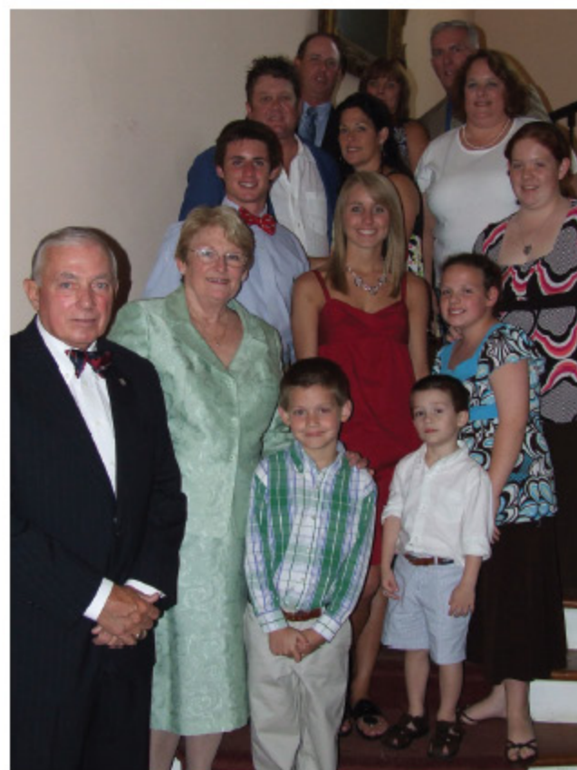
The Hayes family at the dedication.