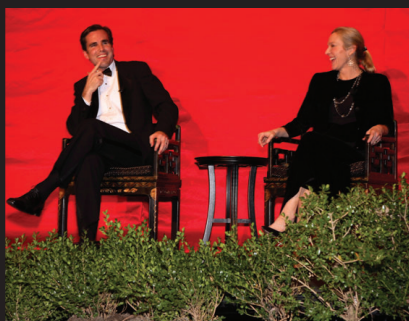
Bob and Lee Woodruff, honored guests and speakers for the evening, addressed members of the Rx Society. The Woodruffs discussed the vital role quality healthcare played in Mr. Woodruff's recovery from a traumatic brain injury sustained on a trip to the Middle East while reporting for ABC News.