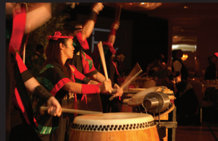
Members of Fushu Daiko, an authentic Asian drumming group, welcomed guests as they entered the ballroom.